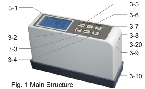
Fig. 1 Main Structure