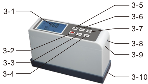
Fig. 1 Main Structure